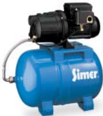
Model 2802E 3/4 HP 1 Year Warranty