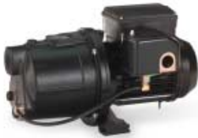
Model 2802 3/4 HP 1 Year Warranty